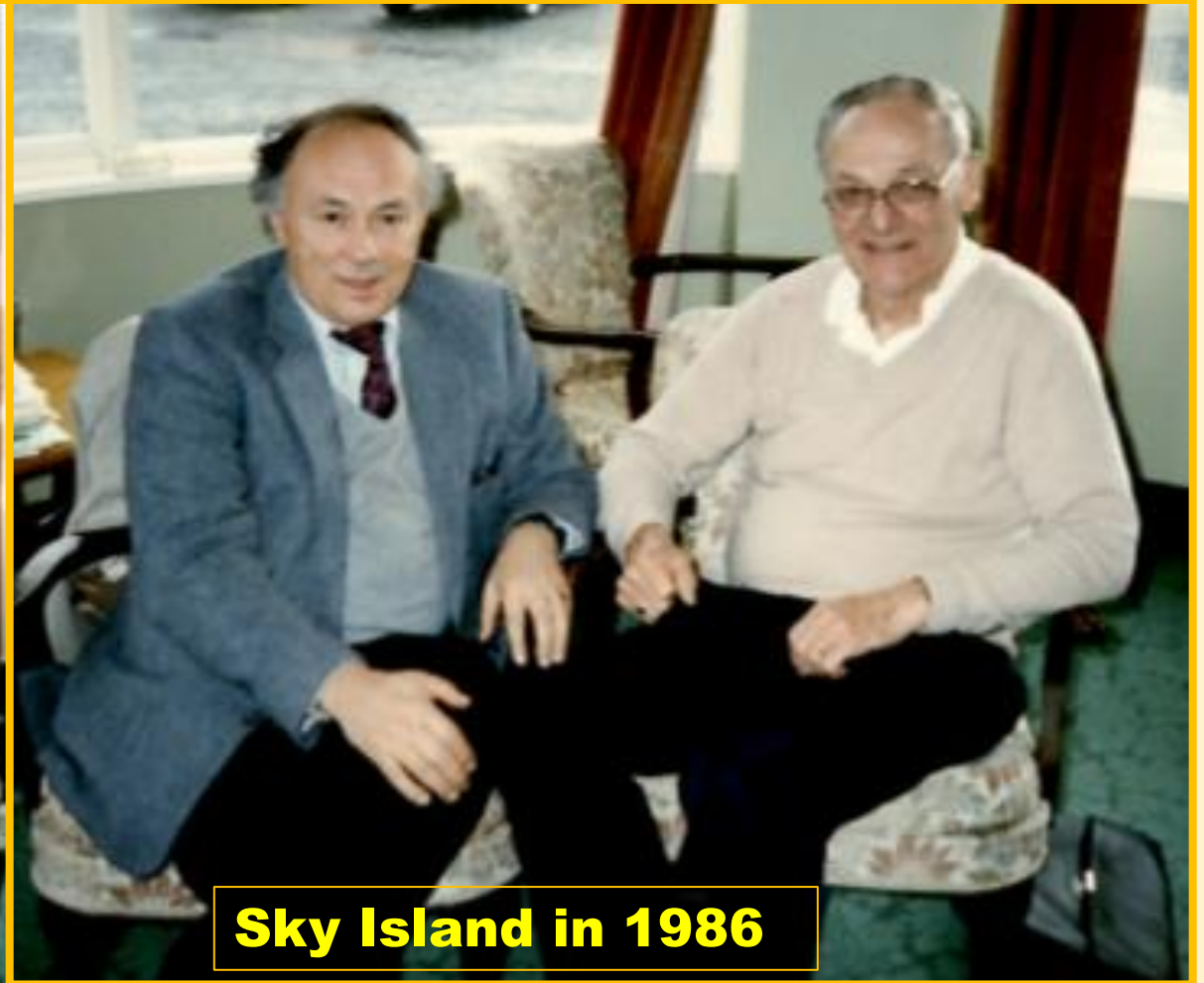
Sky Island in 1986