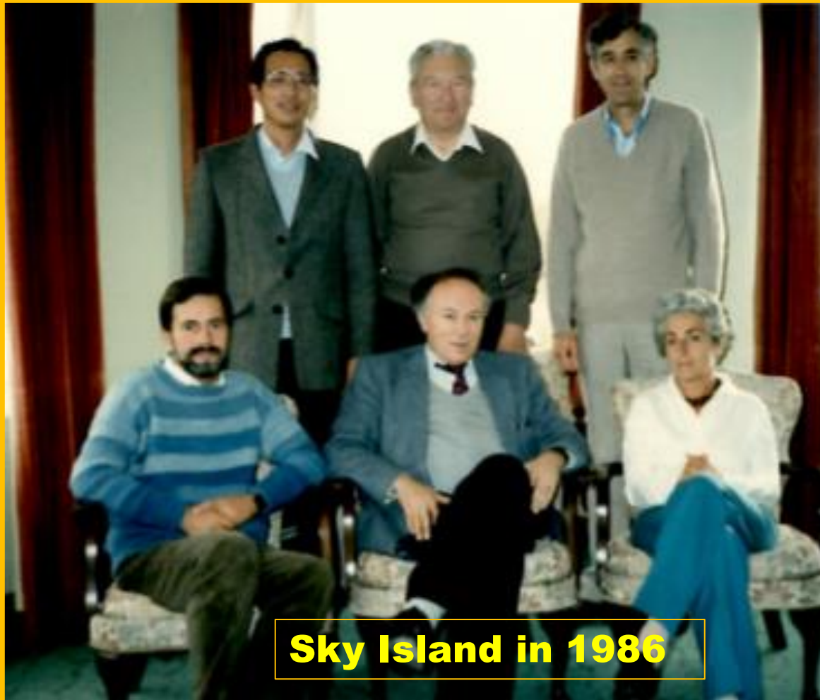
Sky Island in 1986

Two giants reformed the society from ISP to ISPRS in 1980